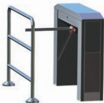
Arm position for normal access control

In the „escape“ position, the two arms are situated beneath the turnstile body, keeping the passageway completely clear. This allows disabled persons or deliveries to pass through the turnstile and clears the way for mass exit at the end of an event. Triggered by a central fire alarm, emergency exit terminal or emergency button, this escape position allows evacuation through the entrance area without additional mechanical work.