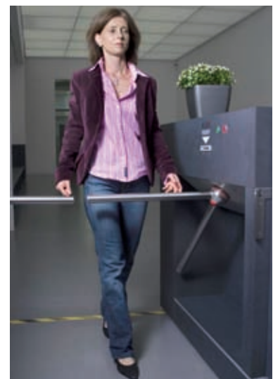
Arm position when access is attempted without authorization