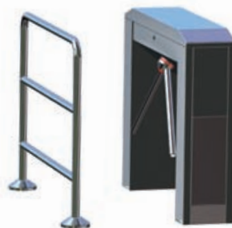
Arm position for evacuation or barrier-free entry